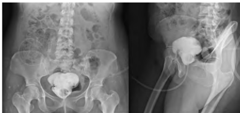
Figure 3: Cystogram 3 weeks after augmentation cystoplasty